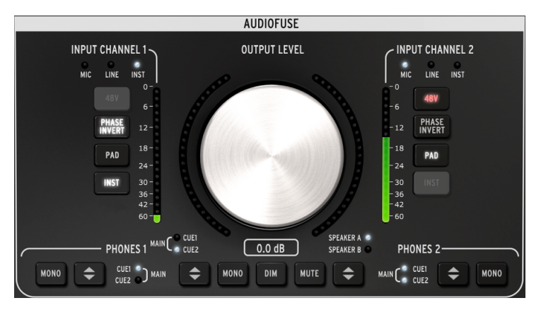
The Control Center's main input/output section

This area of the AudioFuse Control Center window most closely resembles the AudioFuse itself. When you press one of the front-panel buttons on the physical unit there will be a corresponding change in the AFCC window as well.