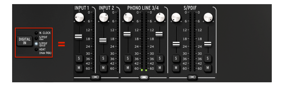
4.4.2.2. S/PDIF display

Another pair of audio channels are added when the Digital Input is set to one of the two S/ PDIF inputs (coaxial or optical). All sample rates between 44100 and 192000 are available.