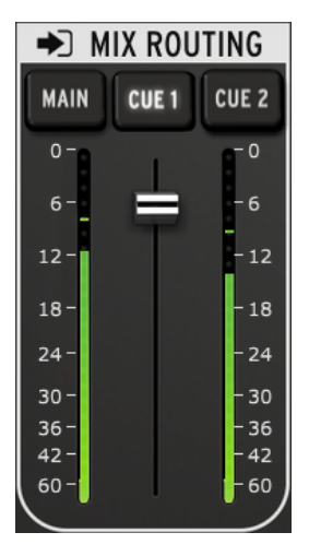
The Mix Routing section

The Mix Routing section enables you to select the destination of the Direct Monitoring Mix.. There are three destinations: Main, Cue 1, and Cue 2. You can select any combination of these output destinations simultaneously.