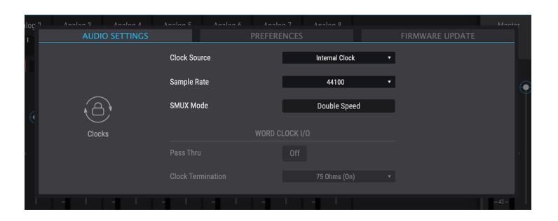
3.5.2.1. AudioFuse 8Pre Audio Settings

These three tabs contain the audio settings, preferences, and firmware update information for the AudioFuse 8Pre.