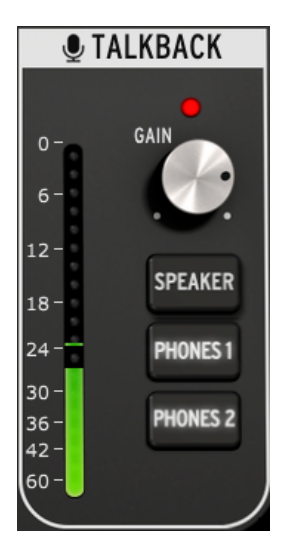
The Talkback section