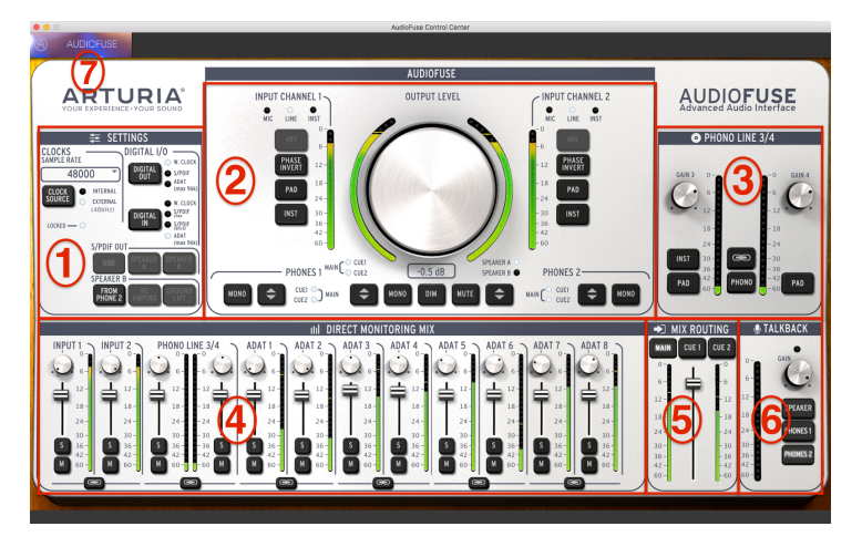
The AudioFuse Control Center interface

The number of controls you see in the main AudioFuse window will change automatically to match your setup. We'll discuss the various configurations in the following chapters.