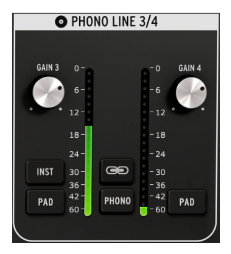
The Phono Line 3/4 section

As simple as this section seems, it greatly expands the functionality of the AudioFuse. You can use it to connect a synthesizer or other instrument, plug in a turntable, or route a guitar through your DAW to the Re-Amping feature.